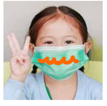
9 BIG WINNERS... 3 KID CATEGORIES!

Entries will be displayed from Aug 7-Aug 28